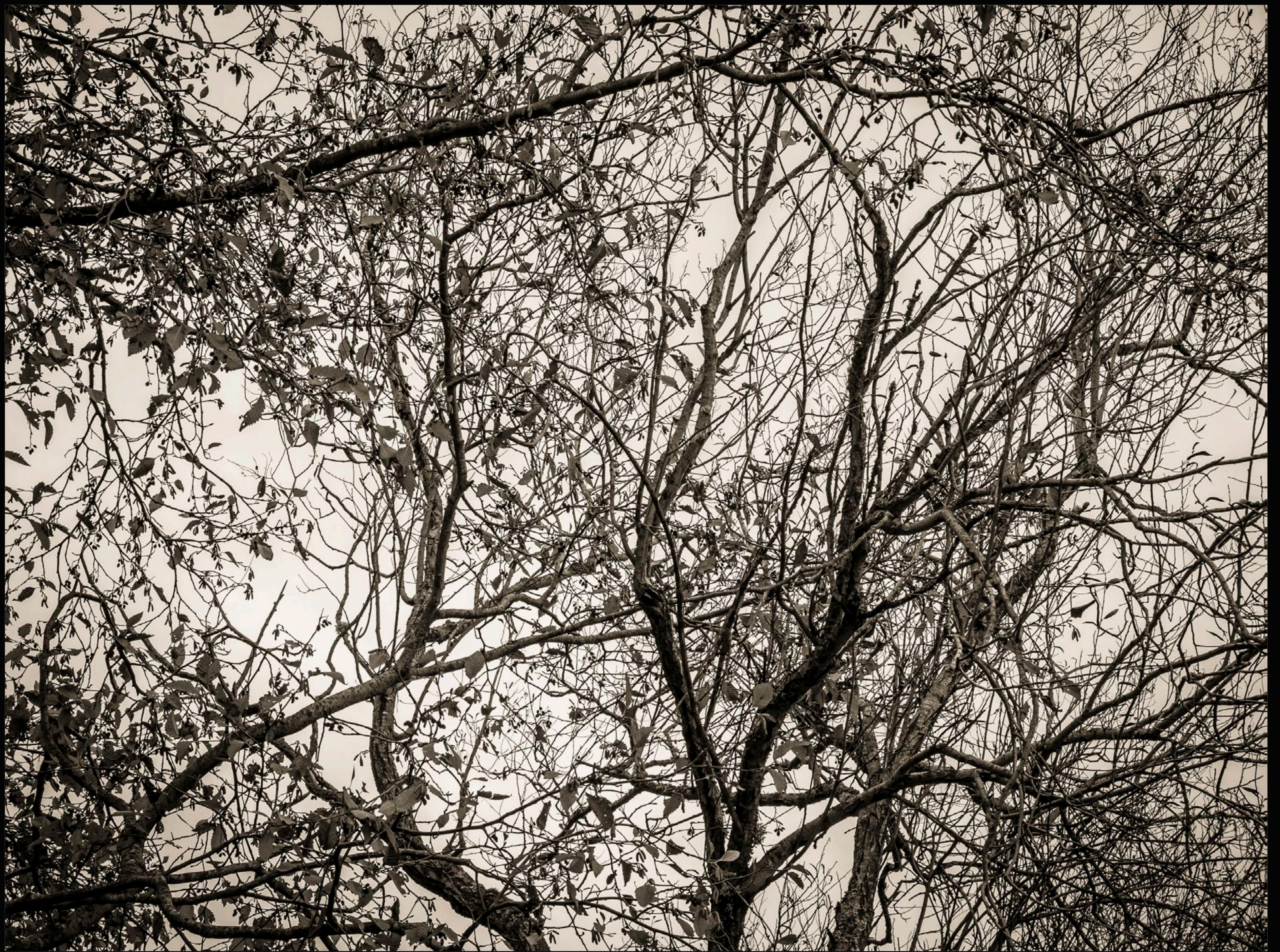
Winter Trees Folio VII A BROOKS JENSEN ARTS PUBLICATION