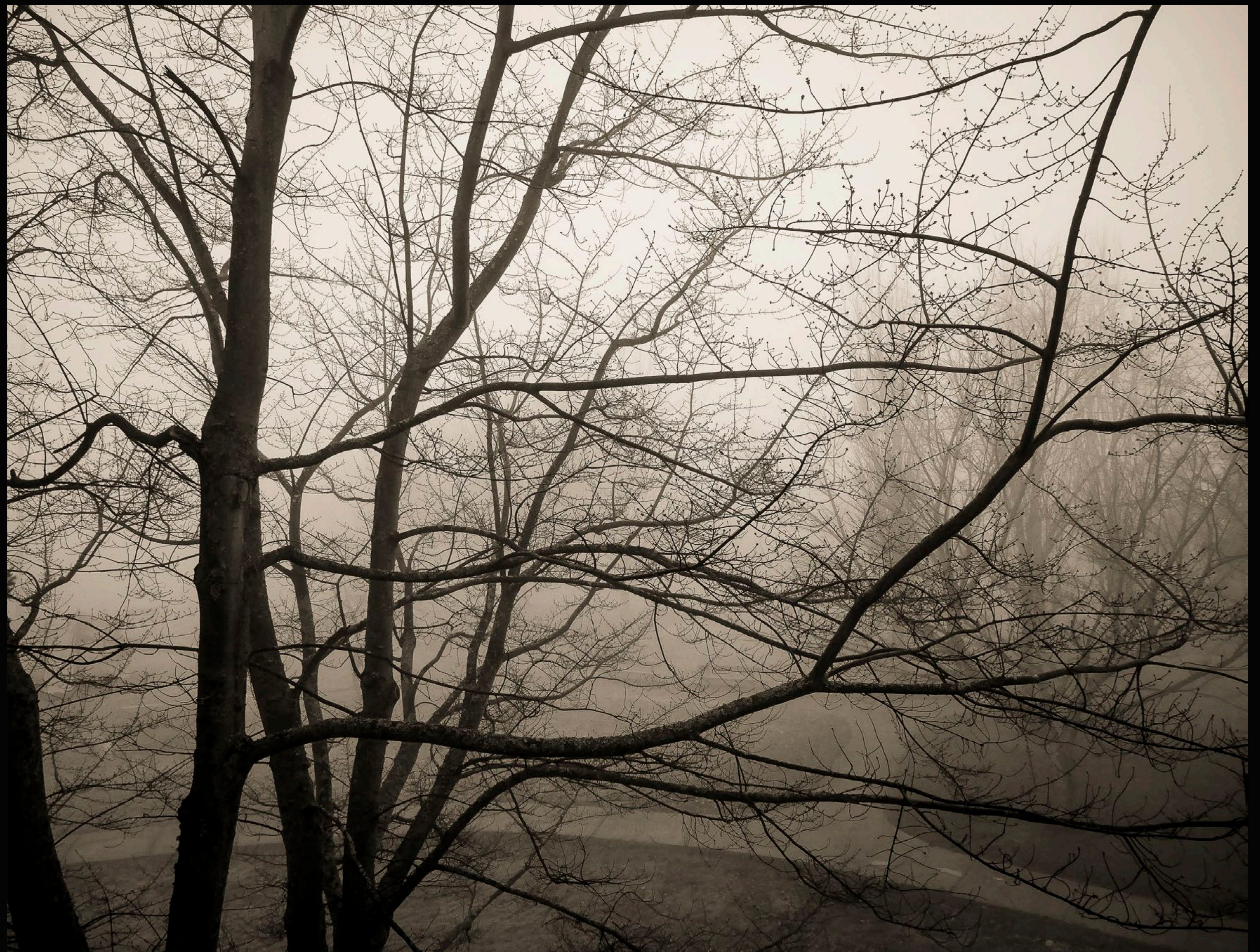
Winter Trees Folio VII A BROOKS JENSEN ARTS PUBLICATION