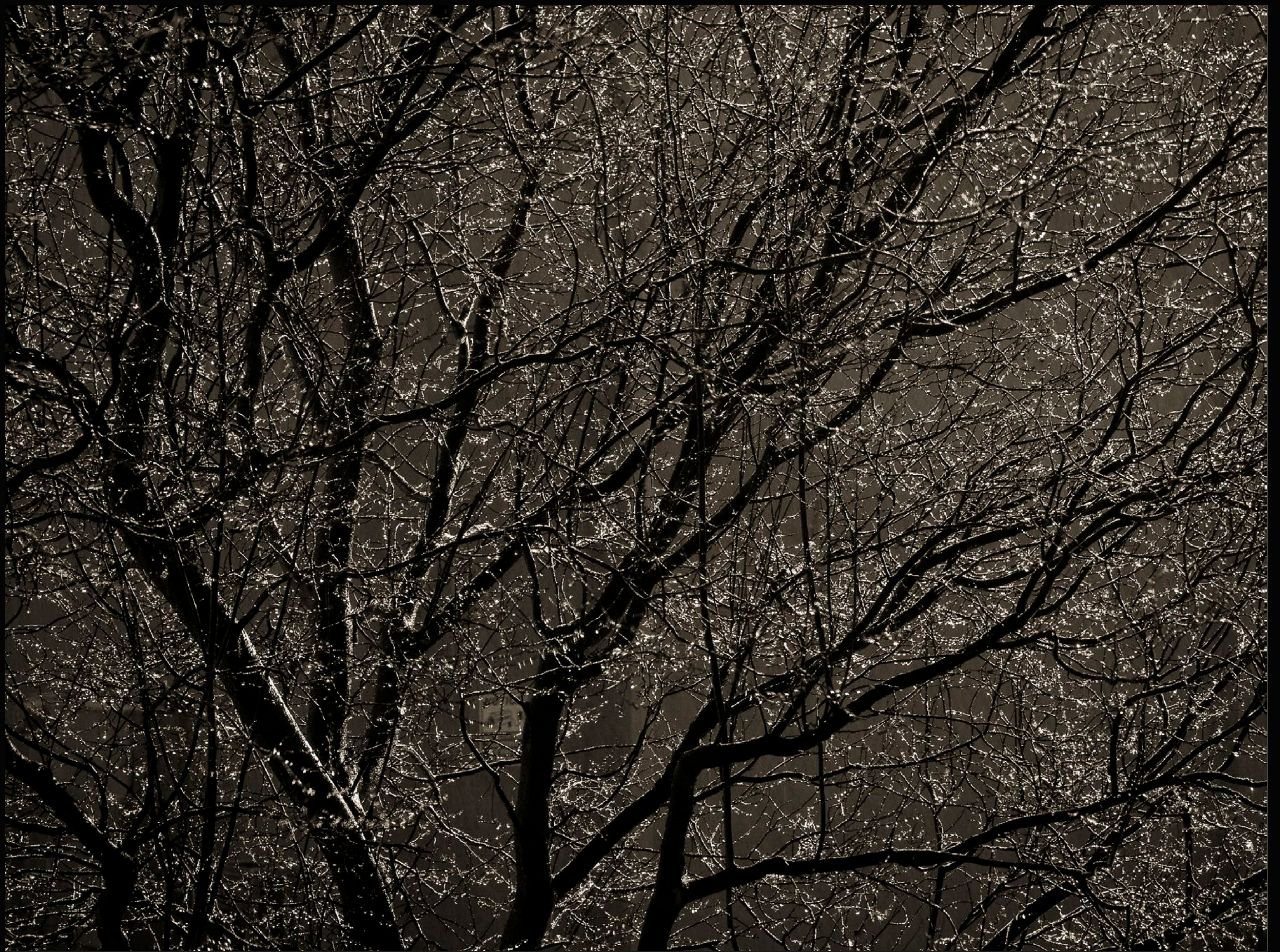
Winter Trees Folio VII A BROOKS JENSEN ARTS PUBLICATION