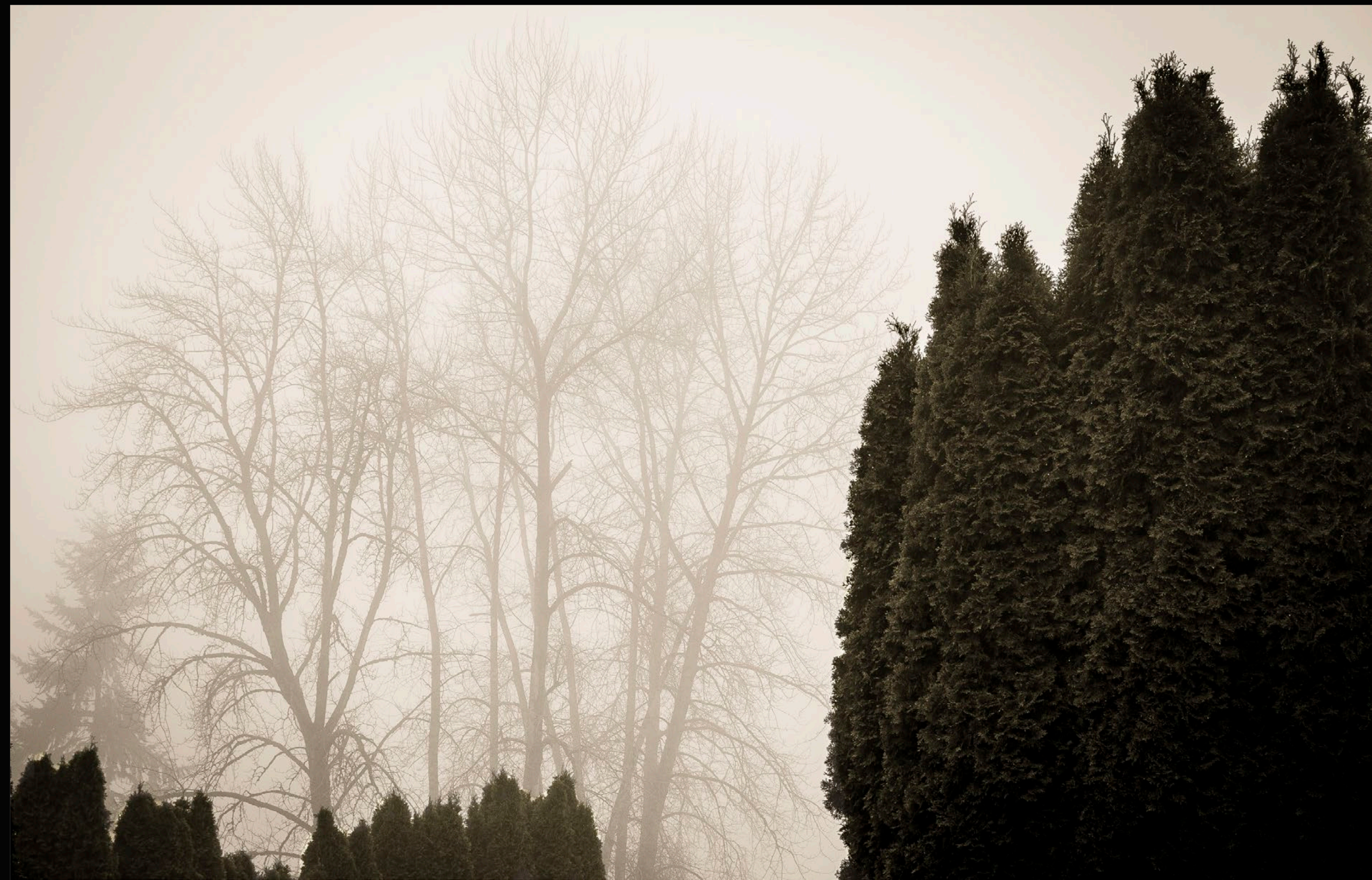
Winter Trees Folio VII A BROOKS JENSEN ARTS PUBLICATION