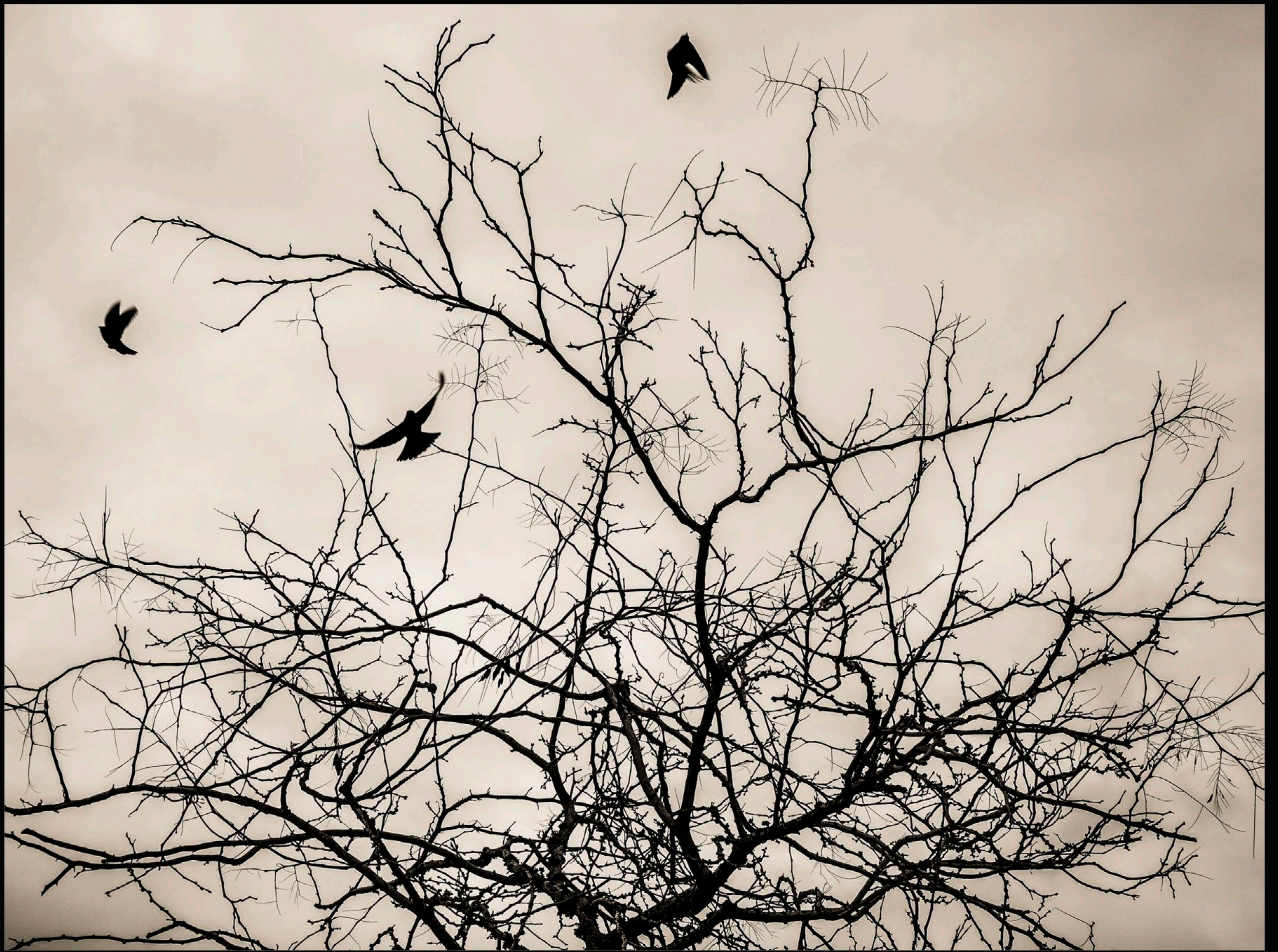
Winter Trees Folio VII A BROOKS JENSEN ARTS PUBLICATION