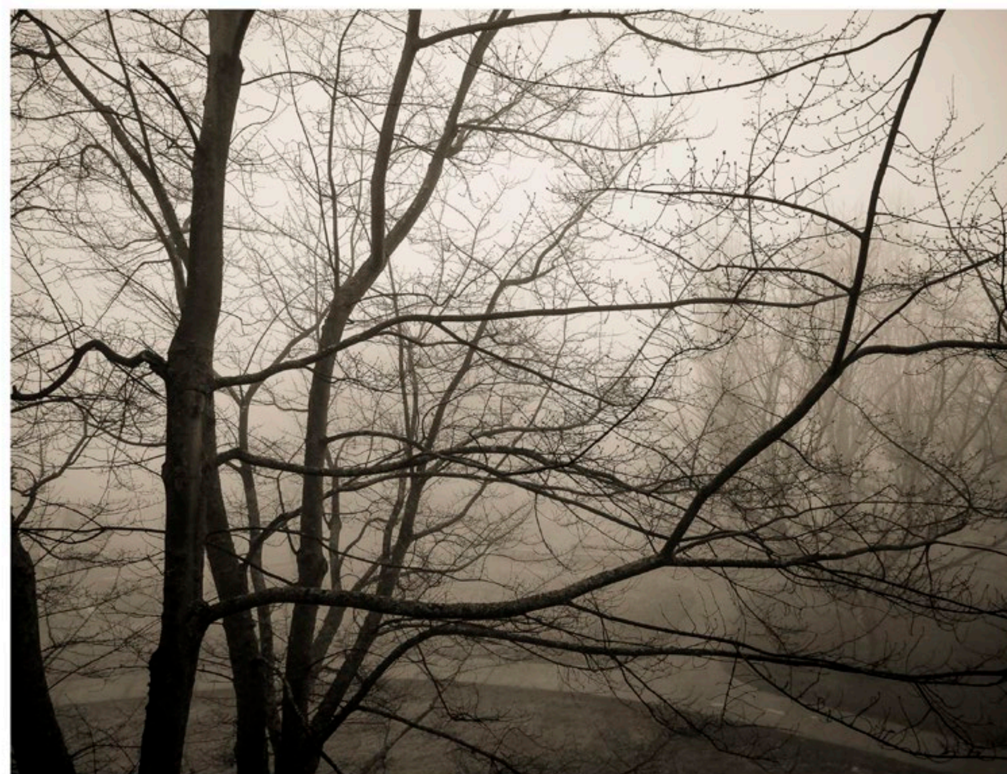
WINTER TREES VII ~ BROOKS JENSEN

Online Direct Order via your web browser